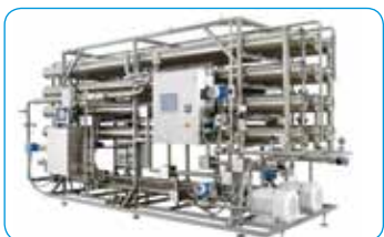
INDION® Integrated Dye Desalting, Water Recovery & ZLD System

* In collaboration with Rochem Group S.A.