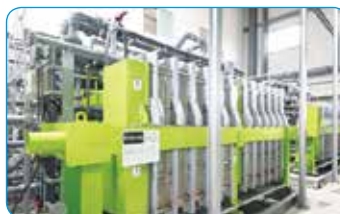
Electrodeialysis Reversal (EDR)

* In collaboration with ASTOM ACROPL Corporation