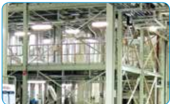
INDION® Multi-Effect Evaporator (MEE)

Ion Exchange (India) Ltd. offers a complete portfolio of advanced environmental products, solutions and services for industrial, institutions and municipal segments. Technology solutions encompass water, liquid, gaseous effluents, solid waste, bio-solids and renewable energy, while services include consultancy, turnkey contracting, O&M and BOOT projects.