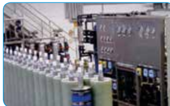
INDION® Plate Frame (DT/PF) RO system*

* In collaboration with Rochem Group S.A.